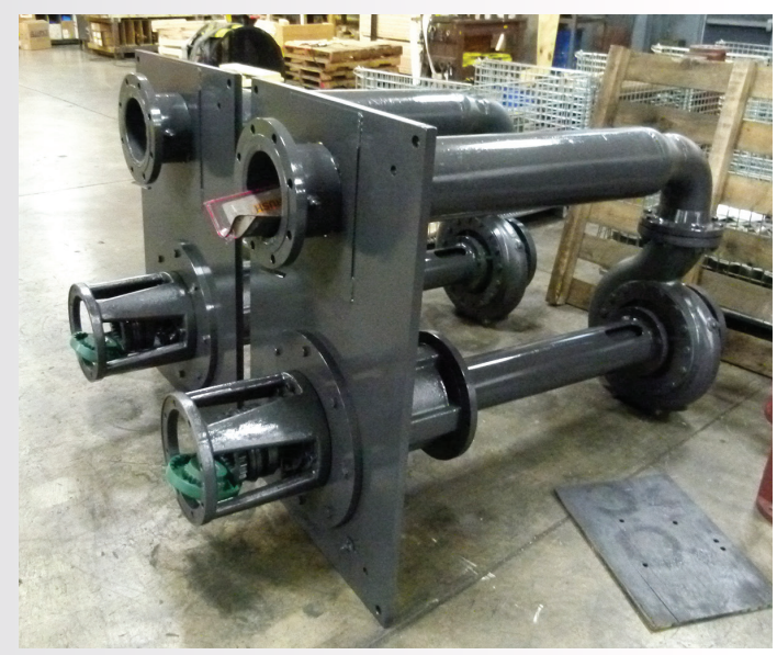
Tim Keetor shown here working on one of two Giants. These 7550 Vortex Pumps are 75 HP, 1600 GPM and designed foe an 88 inch immersion depth. These will be going back to the Dry Ridge facility for a customer witness test for a Great Lakes Pump and Supply customer.