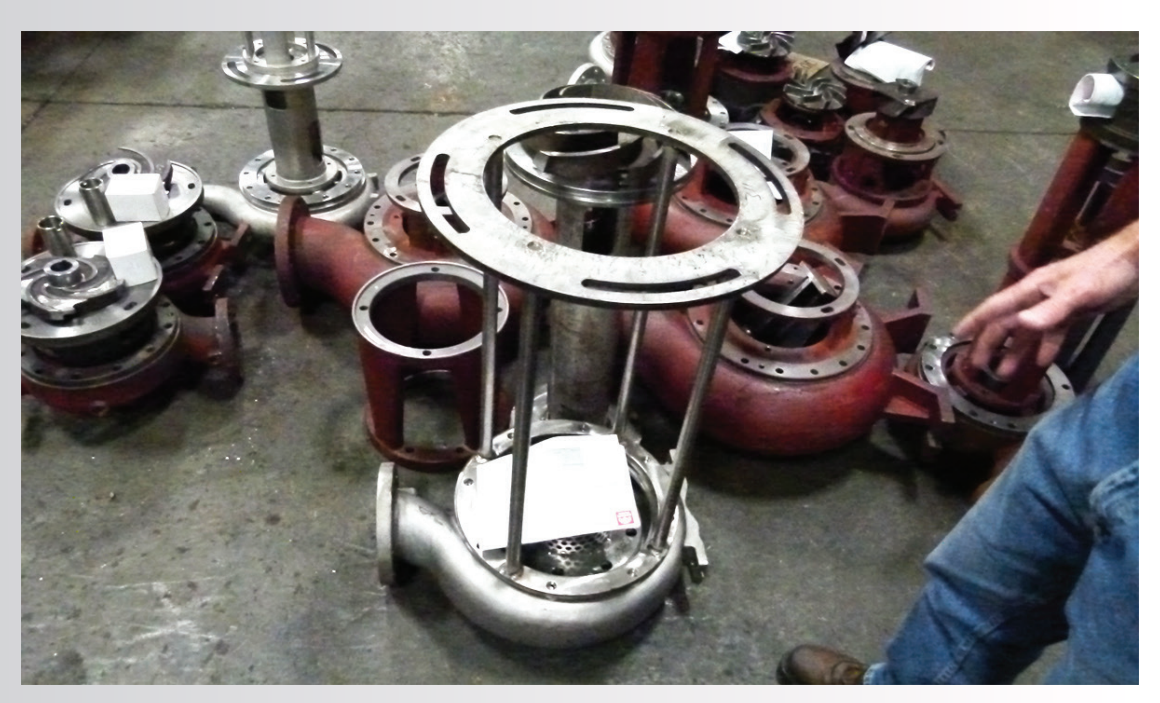
Assembly parts for a 4 x 6 x 13 Top Pull Out 7600