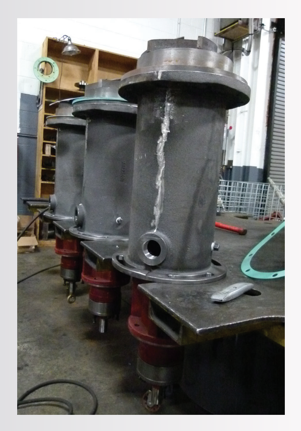
Shown here are Three 3 x 4 x 10B Enclosed Column Pumps ready for finishing..