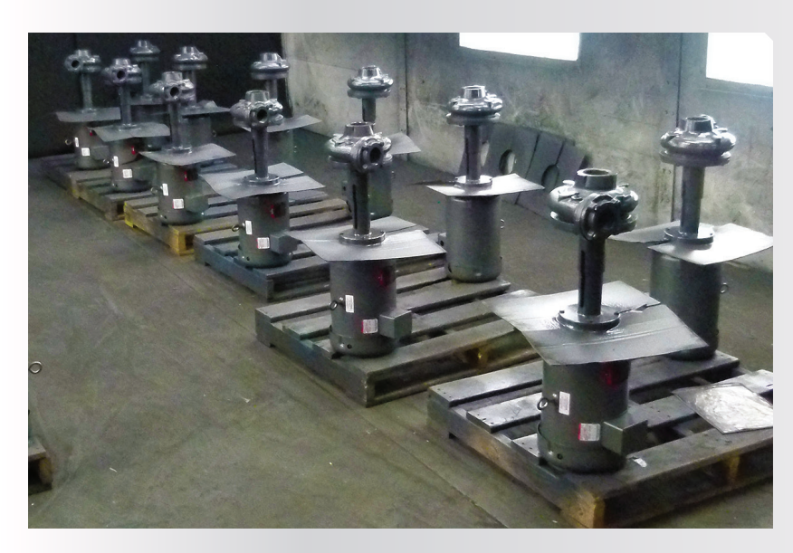
These 7800 Series Parts Washer Pumps are finished off with coats of "Gusher Grey".

Also Shown is a 7600 with a Baldor High Efficiency gold motor.