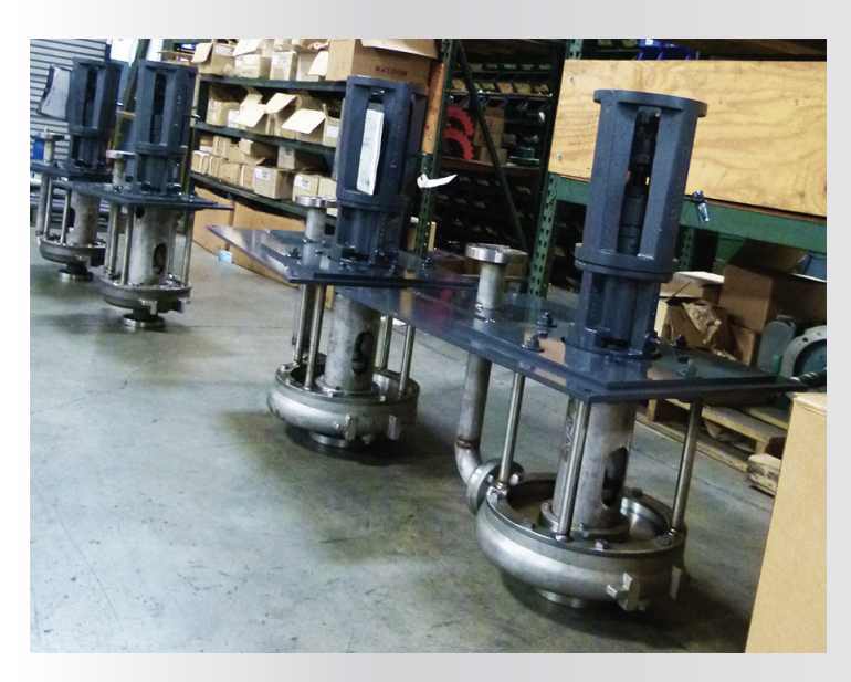
These finished Top Pull Outs are awaiting motors. Also sold by Great Lakes Pump and Supply, these operate at 15 Hp, 45 PSI, pumping 150 GPM.