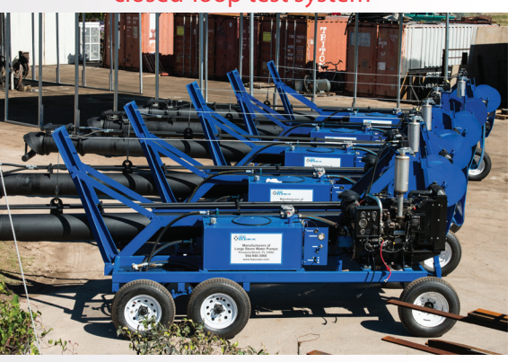
A set of hydraulic power portable pumps built for Thailand.