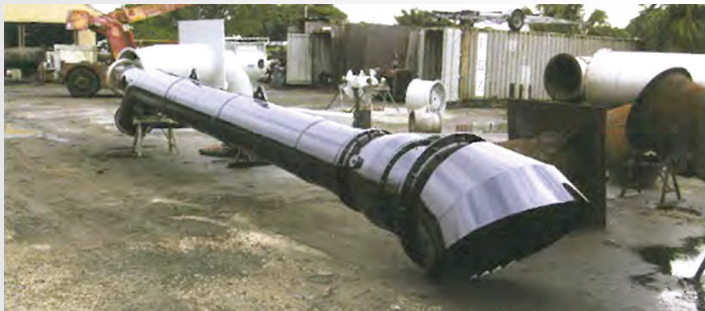
FPI Mixed Flow Pumps