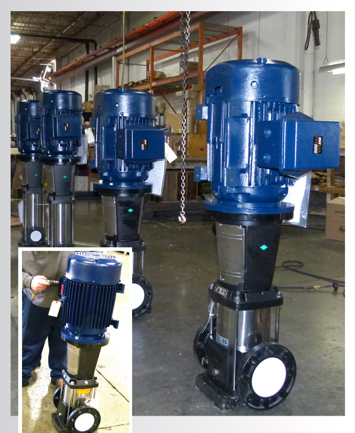
Preparing to apply the Gusher labels before shipping

These specialty Multi-Stage Pumps are for a Mayfran coolant filtration system. Mayfran is a Ruthman Pumpen customer. The Pumps were made In Dry Ridge and Williamstown and from there ship to Ford ChonQuing in China. They are outfitted with 11kw IEC Marathon Ford spec motors. They range from 355 to 700 Litres per minute, and the TDH is 3.5 bar to 7 bar.