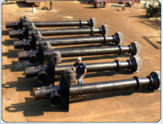
Axial Propeller Pumps