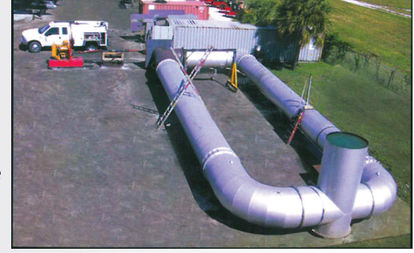
closed-loop test system

our customers expect and get, FPI's Pumps are engineered and built to order.