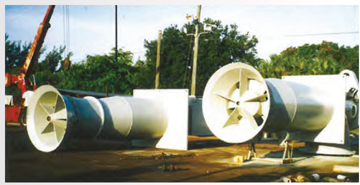
FPI Axial Pumps